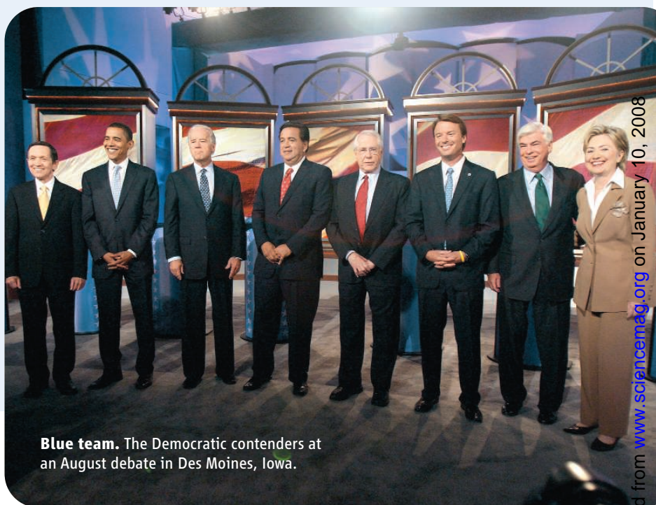
Blue team. The Democratic contenders at an August debate in Des Moines, Iowa.